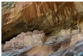
IMAGES OF BEAR'S EARS BEAR'S EARS NATIONAL MONUMENT