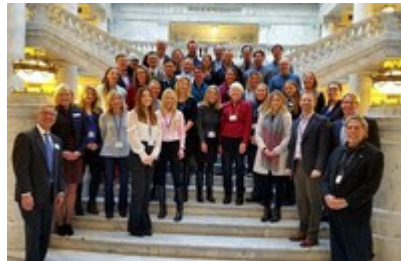
Leadership Park City Class 24 begins the new year with a visit to Utah's Capitol Hill.